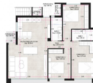
VILLA B (3 bedrooms - 2 bathrooms)