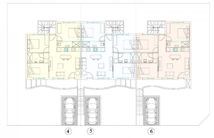
PENTHOUSE - PLANTA ALTA